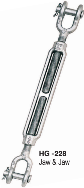
HG -228 Jaw & Jaw

Meets the performance requirements of Federal Specifications FF- 791b, Type 1 Form 1 - CLASS 7, and ASTM F-1145, except for those provisions required of the contractor. For additional information, see page 476.