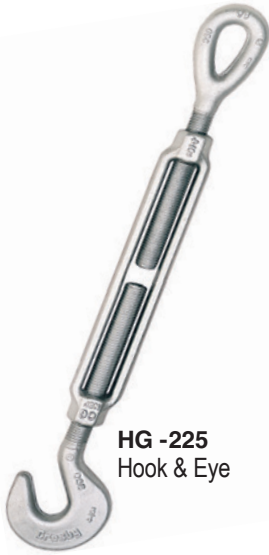
HG -225 Hook & Eye

Meets the performance requirements of Federal Specifications FF-791b, Type 1 Form 1 - CLASS 4, and ASTM F-1145, except for those provisions required of the contractor. For additional information, see page 476.