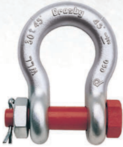
G-2140 / S-2140

G-2140 meets the performance requirements of Federal Specification RR-C-271F, Type IVA, Grade B, Class 3, except for those provisions required of the contractor. For additional information, see page 452.