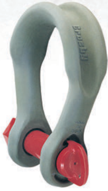
G-2160 / S-2160