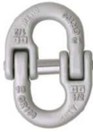
A-1337 10 Alloy Connecting Link