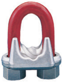
G-450 Red-U-Bolt® Clip

Crosby Clips, all sizes except 68-72mm and 85-90mm meet the performance requirements of EN13411:2003. Crosby Clips, all sizes 6 mm and larger, meet the performance requirements of Federal Specification FF-C-450E TYPE 1 CLASS 1, except for those provisions required of the contractor. For additional information, see page 476.