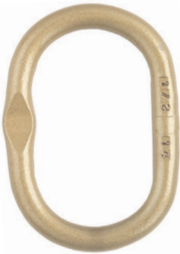
A-344 Welded Master Links

Ultimate Load is 5 times the Working Load Limit. Applications with wire rope and synthetic sling generally require a design factor of 5. Based on single leg sling (in-line load), or resultant load on multiple legs with an included angle less than or equal to 120 degrees. ** Proof Test Load equals or exceeds the requirement of ASTM A952(8.1) and ASME B30.9. For use with chain slings, refer to page 245 for sling ratings and page 240 for proper master link selection.